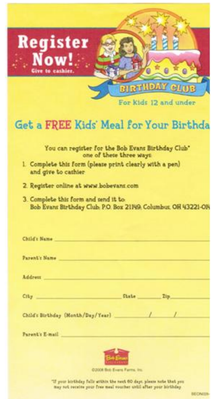
Kids Birthday Club Registration