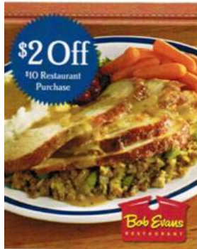
$2 off Coupon