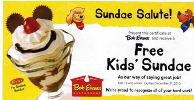
Free Kids Sundae Coupon