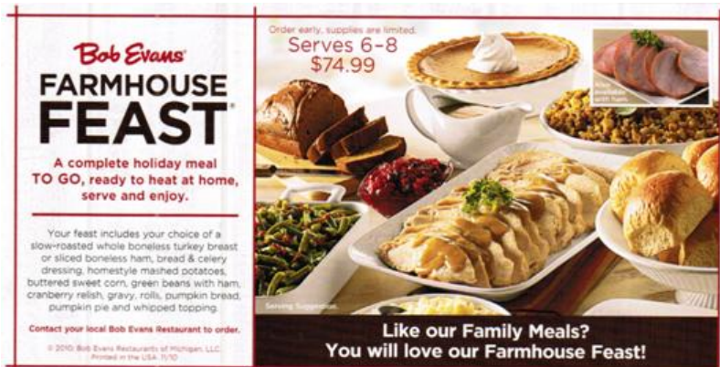
"Farmhouse Feast" (Carry-out items) Print Advertisement